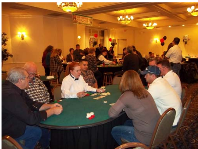
Gulf Coast PHCC members and guests enjoying a Texas Hold'em game at Casino Night 2011!