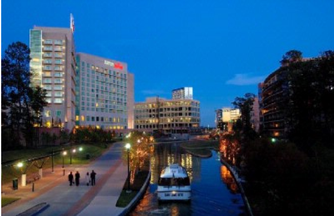
The Woodlands Marriott Waterway Hotel ~Conference Hotel

There are many exciting events and continuing education classes planned.